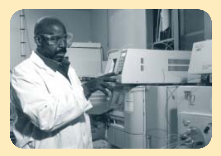
RESEARCHERS IN EOHSI'S ANALYTICAL CENTER CONDUCT INDEPTH ANALYSIS OF HEAVY METALS AND OTHER SUBSTANCES.

Through the Computational Chemodynamics Laboratory, state-of-the-art computational models have been developed to estimate exposures and doses. Currently this laboratory supports the activities of three research centers at EOHSI: The Ozone Research Center, funded by USEPA and NJDEP, provides a unique capability to perform source-to-dose modeling and population exposure assessments for gaseous photochemical air