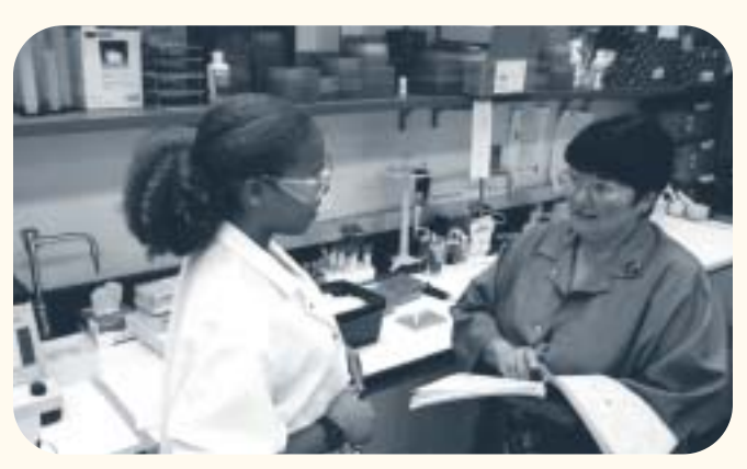
TOXICOLOGY DIVISION MEMBERS PROVIDE MUCH OF THE INSTITUTE'S BASIC SCIENCE RESEARCH.

The National Cancer Institute has awarded a program project to members of the Toxicology Division entitled "Inhibition of Carcinogenesis by Tea and Tea Constituents." During this 5 year project researchers will conduct systematic studies on the molecular mechanisms by which tea constituents inhibit skin and lung carcinogenesis. The molecular mechanisms will be investigated both in cell lines and animal models. The bioavailability and bio-transformation of the tea constituents will also be studied in animal models and humans. A key approach is to integrate these studies to obtain mechanistic information that will be useful for the prevention of human cancers.