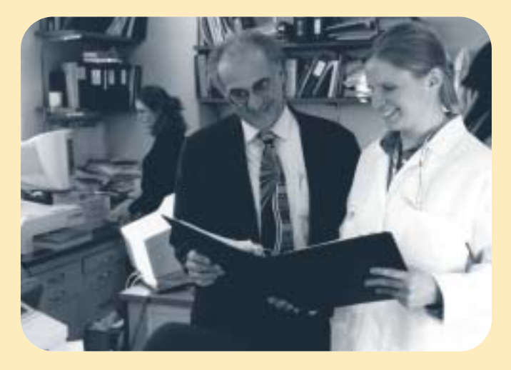
MENTORING OF STUDENTS IS AN INTEGRAL PART OF EOHSI.

The NIEHS Center and CRESP are examples of programs that evolved as a result of scientists from diverse disciplines, working together to establish methods to address environmental problems. In addition, the EPA Center for Exposure and Risk Modeling and the Ozone Research Center address the science of exposure to inform public policy.