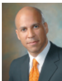
Mayor Cory Booker