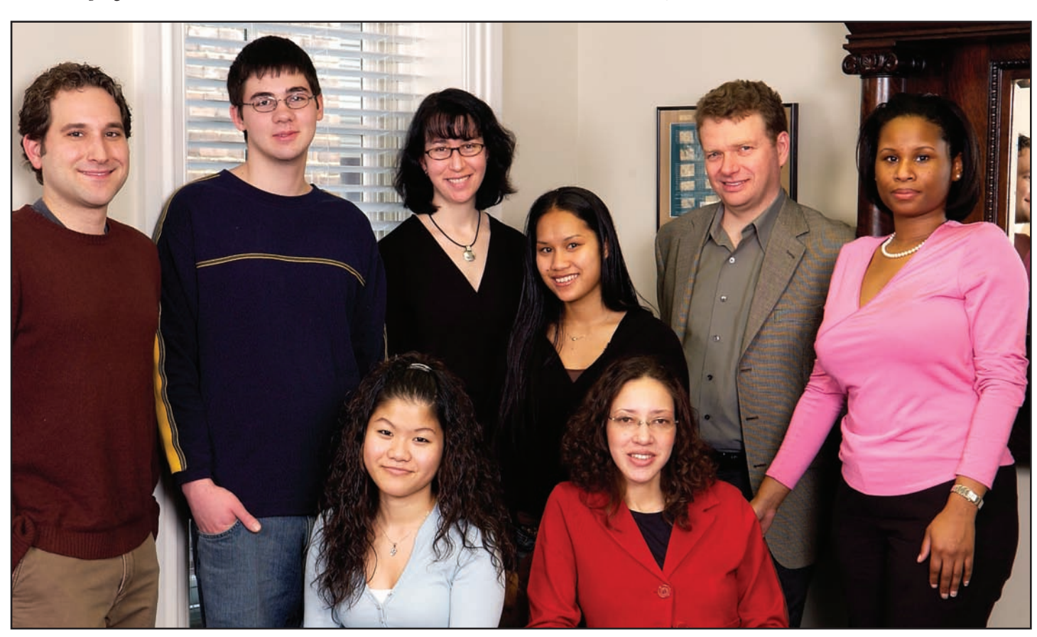
Faculty, staff and students associated with the Center for Children and Childhood Studies

The Center's signature outreach project, the Camden Campaign for Children's Literacy, has influenced the lives of more than 40,000 chil-